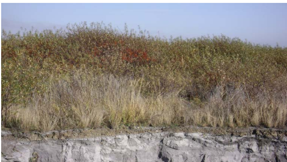
Figure 2 - Thick thickets of sea buckthorn on the surface of the ash dump PTEC-2

Elements of mineral nutrition, which are part of plants in significant quantities, ranging from a few percent to hundredths of it, are called macroelements. These include nitrogen, phosphorus, potassium, calcium, magnesium, sulfur, iron, manganese. If there are chemical elements in plants from thousandths to hundredths of a percent, then they are called trace elements - these are boron, zinc, copper, cobalt, molybdenum, nickel, vanadium, iodine. The dense thickets of sea buckthorn on the surface of ash dumps testify to the rich trace element composition (Figure 2).