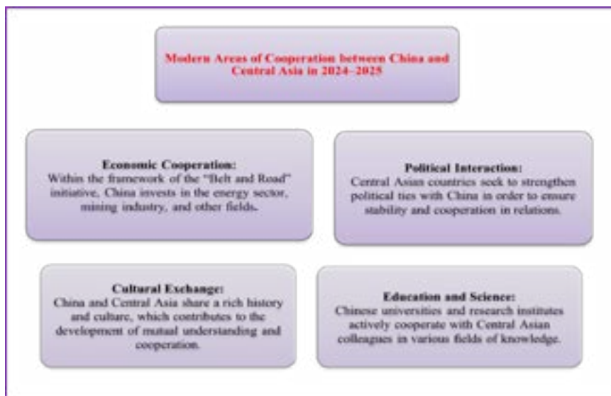
Figure 3 — Modern framework of collaboration between China and Central Asian nations

China is positioned as one of the most powerful powers and is the largest driver and most active supporter of economic cooperation with Central Asian countries, which implies that the state is focused on strengthening new areas beyond the traditional areas of cooperation. We are talking about such areas as digital economy, green energy, low-carbon projects, artificial intelligence, information communications, modern agriculture, cross-border e-commerce and other areas (Zhao Huasheng, 2022).