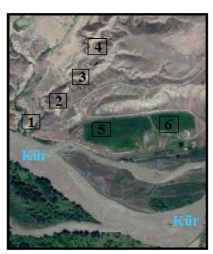
Figure 1 – Characteristic soil cuts place of the first observation and example gorund

An absolute height from the sea level of the first observation and example grounds varies by 220 m and 370 m. A problem of the influence of the modern geomorphological processes and antropoghenic activity an soil cover from the coordinates towards north direction to the low upland was paid attention (figure 1).