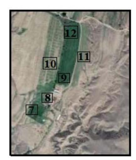
Figure 2 – Characteristic soil cuts place of the 2nd observation and sample ground

The second observation and example ground is taken as a continuation of the first one. The geographical coordinages of the station are 45^{\circ}40'30,3" east length and north width in the south, 45^{\circ}42'10,8" east length and 41^{\circ}8'54,81" north width in the east, 45^{\circ}40'32,8" east length and 41^{\circ}9'32" north width in the north, but 45^{\circ}40'98,18" east length and 41^{\circ}9'98,7" north width in the west. The zone consists of weak inclined plain at 370-380 metres from sea level (figure 2).